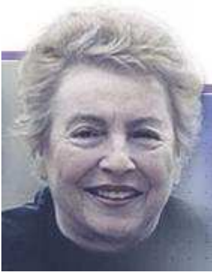
Dame Steve Shirley

“Giving is a social activity in my view, it’s not really a financial one .”