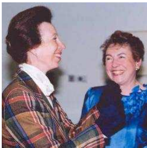
Dame Steve Shirley. With the Princess Royal who opened the Priors Court autism school funded with £15million from The Dame Stephanie Shirley Foundation.

try and strengthen philanthropy. “We want to make sure that philanthropic advice is first class and promoted properly by professionals who sit in front of private clients to talk about giving,” she says, “when people are making wills, advisers should be talking about getting involved with philanthropy.”